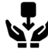
Achievement and Legacy