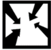
Movement of people