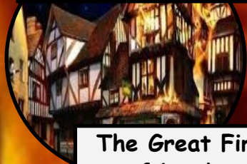
The Great Fire of London

Sequencing the events and adding key dates onto our historical timeline.